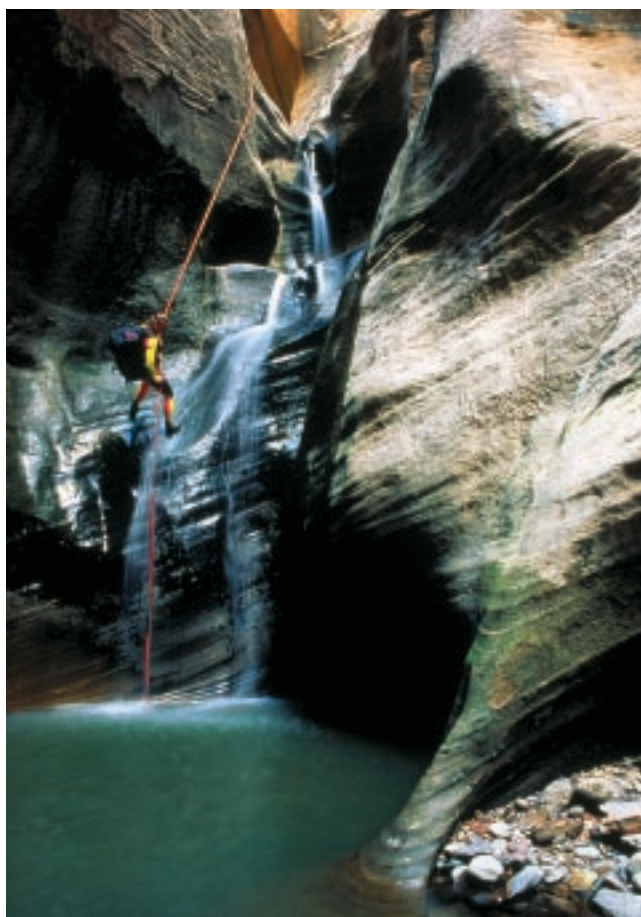
THIS PAGE, ABOVE AND TOP RIGHT: Paria Canyons, Vermillion Cliffs Wilderness, Utah; RIGHT: Zion National Park, Utah. OPPOSITE PAGE: Lime Rock Canyon, Utah.

PARIA CANYONS: Nikon F4s, Nikkor 35mm, Manfrotto 3001 tripod and ballhead; PENTAX 67, Pentax 105mm, Manfrotto 3021 tripod and ballhead; ZION: Nikon F4s, Nikkor 50mm, Manfrotto 3001 tripod and ballhead; LIME ROCK: Pentax 67, Pentax 45mm, Manfrotto 3021 tripod and ballhead; ALL IMAGES: Fujichrome Velvia