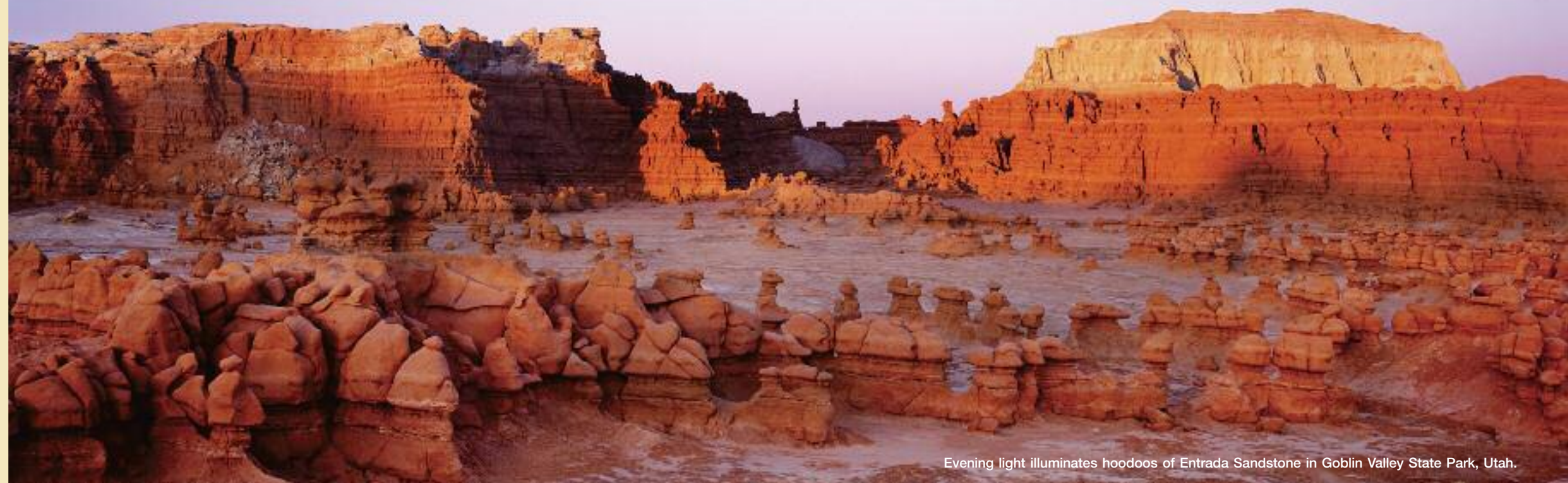
Sunrise illuminates pinnacles and hoodoos carved into the Claron Formation from Bryce

No other place on earth comes close to matching the overwhelming display of bizarre landforms exposed here. What confluence of geological events in the distant past created this remarkable landscape? To sum it up in a nutshell, this crumpled, dissected, convoluted country owes its looks today to the fact that it spent most of the last 500 million years either slightly above or slightly below sea level as a mostly featureless