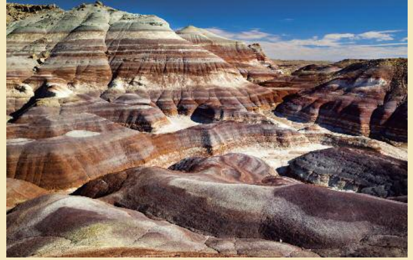
Colorful outcrops of the Brushy Basin Member of the Morrison Formation near Hanksville, Utah.

shoved into the sky. In addition to the creation of individual mountain ranges and monoclines during this period, the entire interior West, from the Sierra Nevada Mountains to western Kansas, was uplifted thousands of feet.